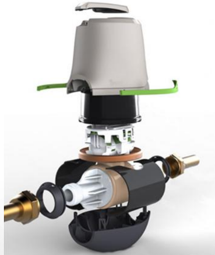
iPERL water meter