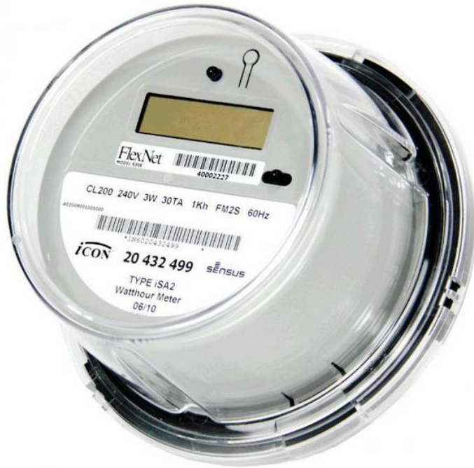
iCON electric meter