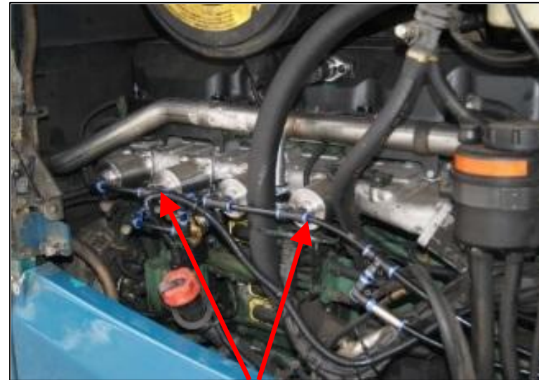
Vulcanaer installed - the shiny parts

Vulcanaer harvests braking energy whenever a bus or truck slows down at a bus stop or in traffic, and captures this as compressed air.