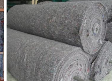
New Mattress Fillings