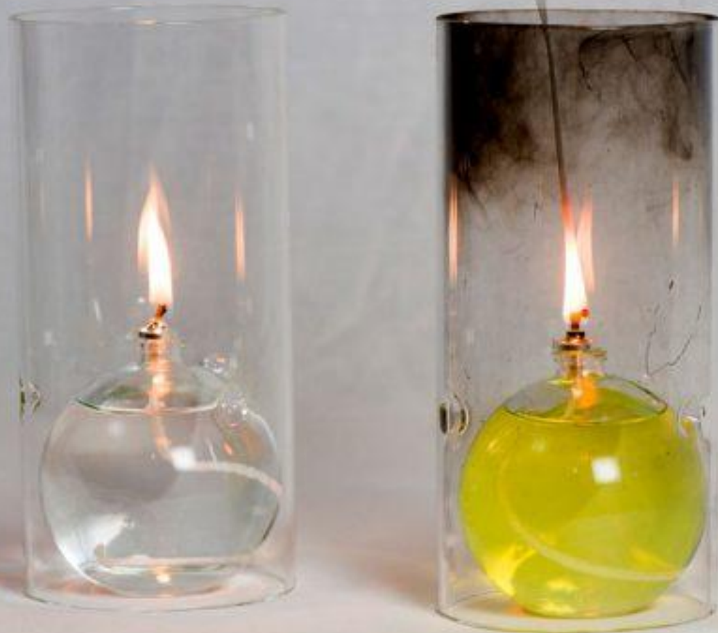
Left: Diesel made using Velocys process; right: diesel from a UK filling station

Product burns more cleanly than conventional fuel... ...as well as the greenhouse gas savings