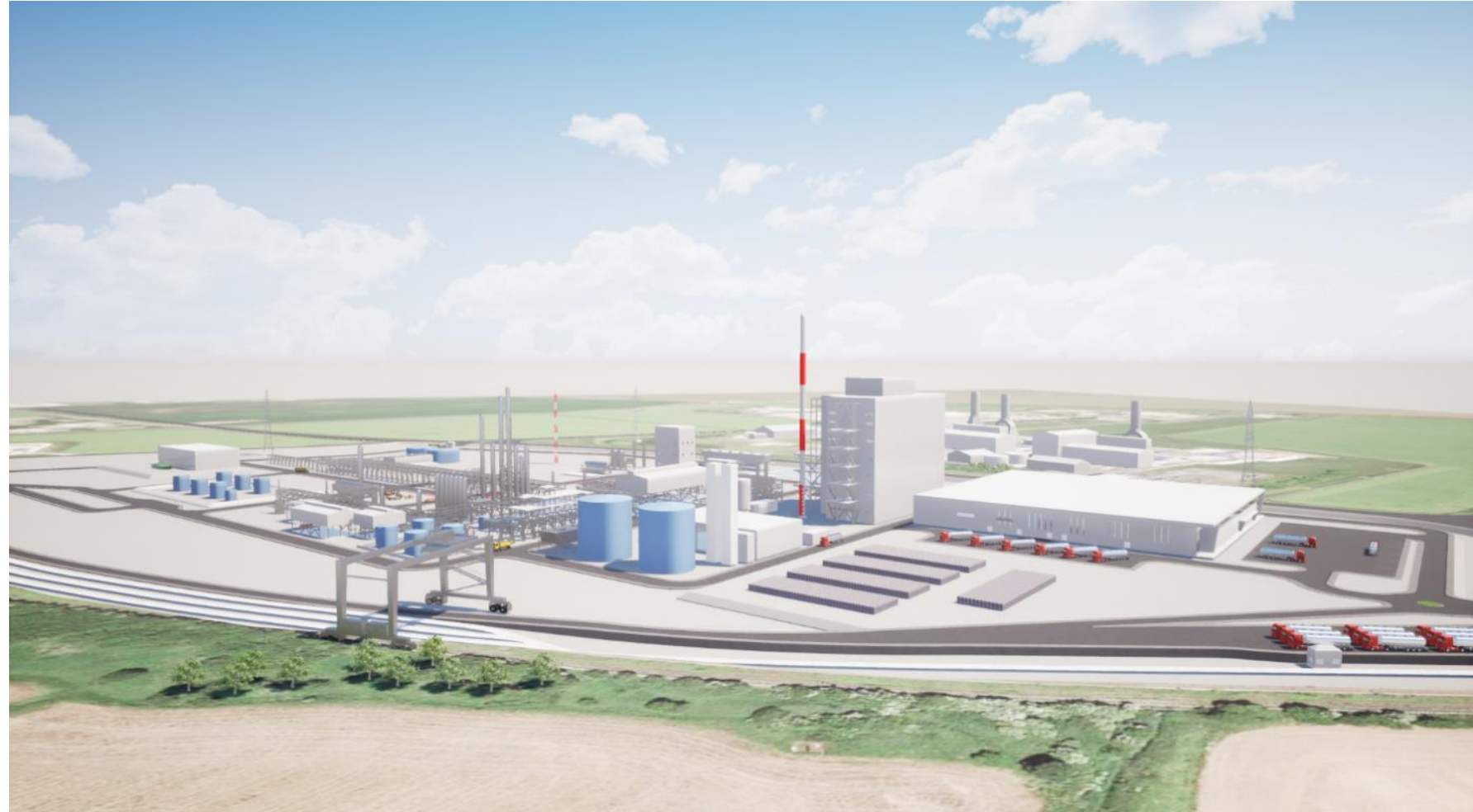
Model of plant on site near Immingham, North East Lincolnshire, UK