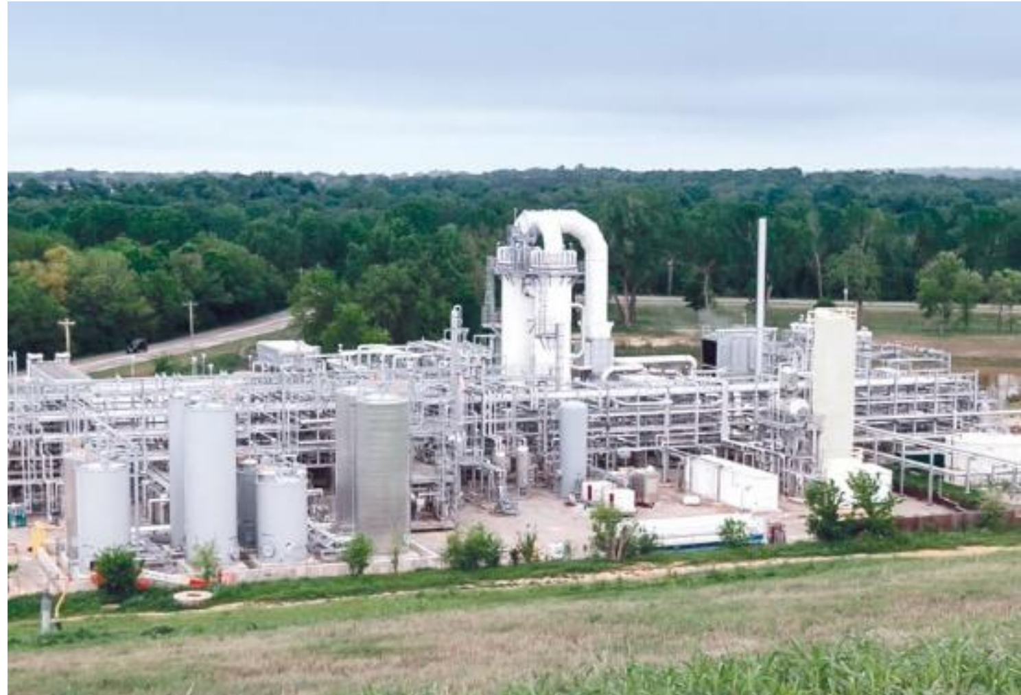
ENVIA plant in Oklahoma City: commercial-scale demonstration of Velocys technology